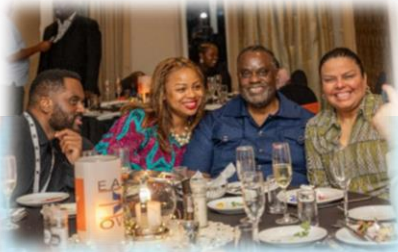
The USA Team