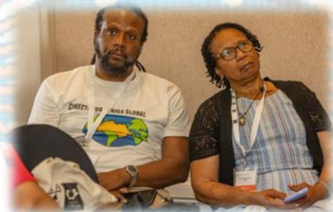
Brother and Sister from Colombia – Afro-descendants Familia sin duda Advocating for African-centered education