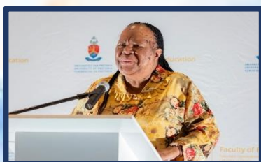
Dr Naledi Pandor Honorary professor in education University of Pretoria Collaborations and partnerships for socioeconomic development